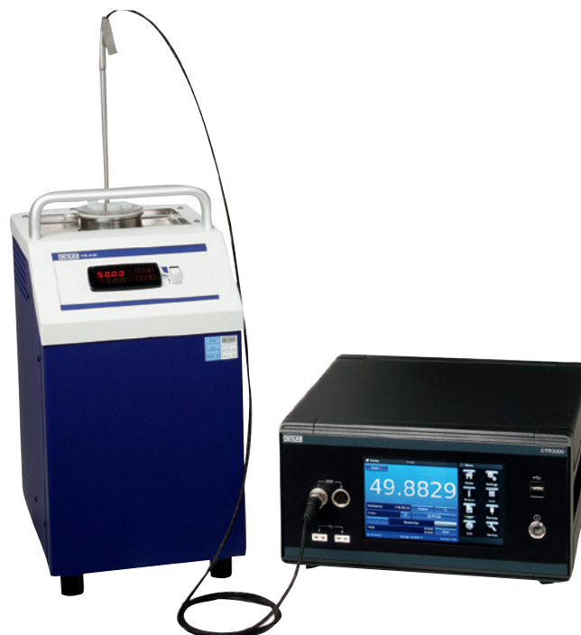
Model CTB9100 micro calibration bath with model CTR3000 multi-functional precision thermometer

All calibration routines can be reproduced for subsequent test processes.