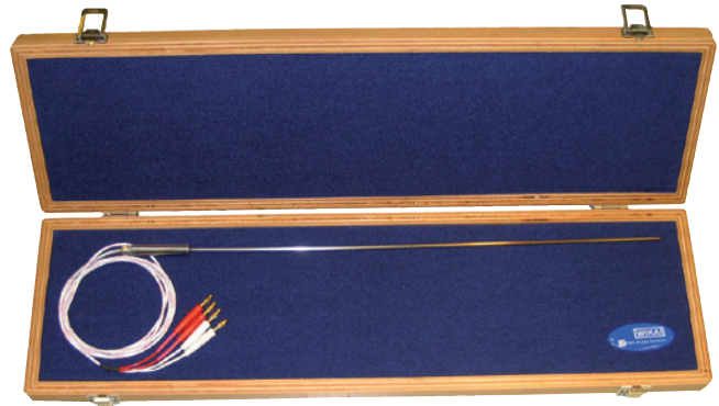
Platinum resistance thermometer model CTP2000