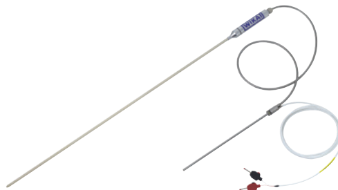
Thermocouple model CTP9000